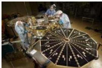
Lockheed Martin | NASA's Phoenix Mars Lander was assembled and tested at the company's Denver-area facility. (NASA)

A big reason for the growth in aerospace locally was a spike in employment triggered by the creation of Centennial-based United Launch Alliance, the joint venture between Lockheed and Boeing to develop rockets.